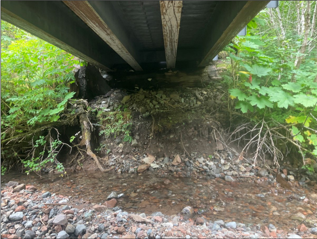
Figure 2.—Bridge abutment with some riprap eroded at waypoint 1469.