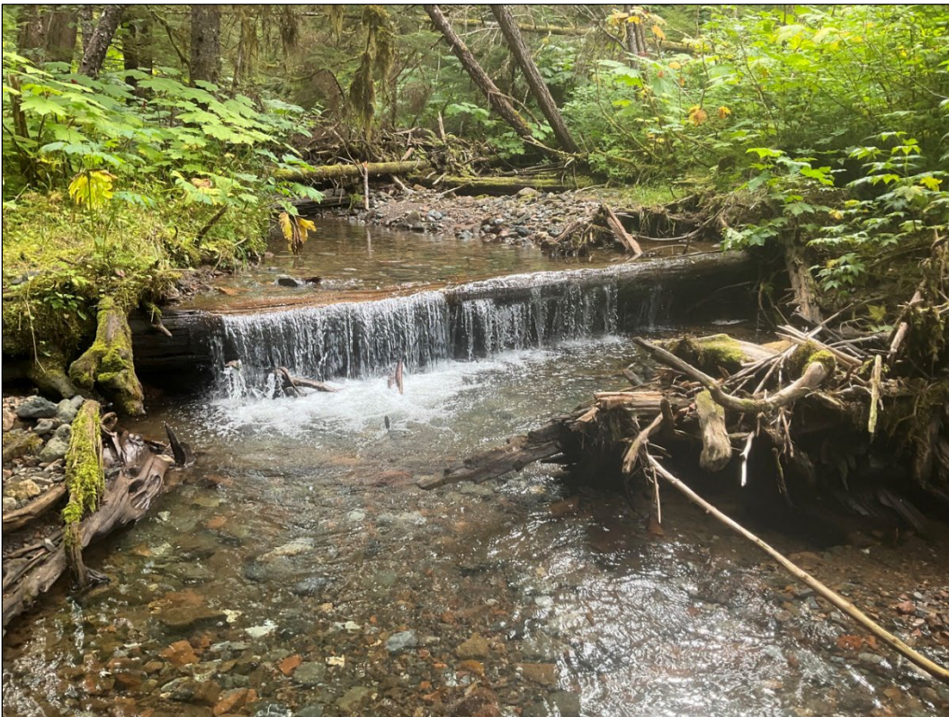
Figure 3.—Channel with log jam falls at waypoint 1471.