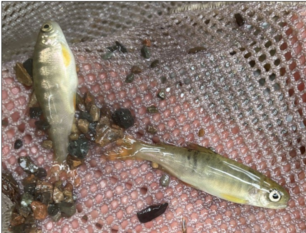
Figure 1.–Juvenile coho salmon captured at waypoint 1470.